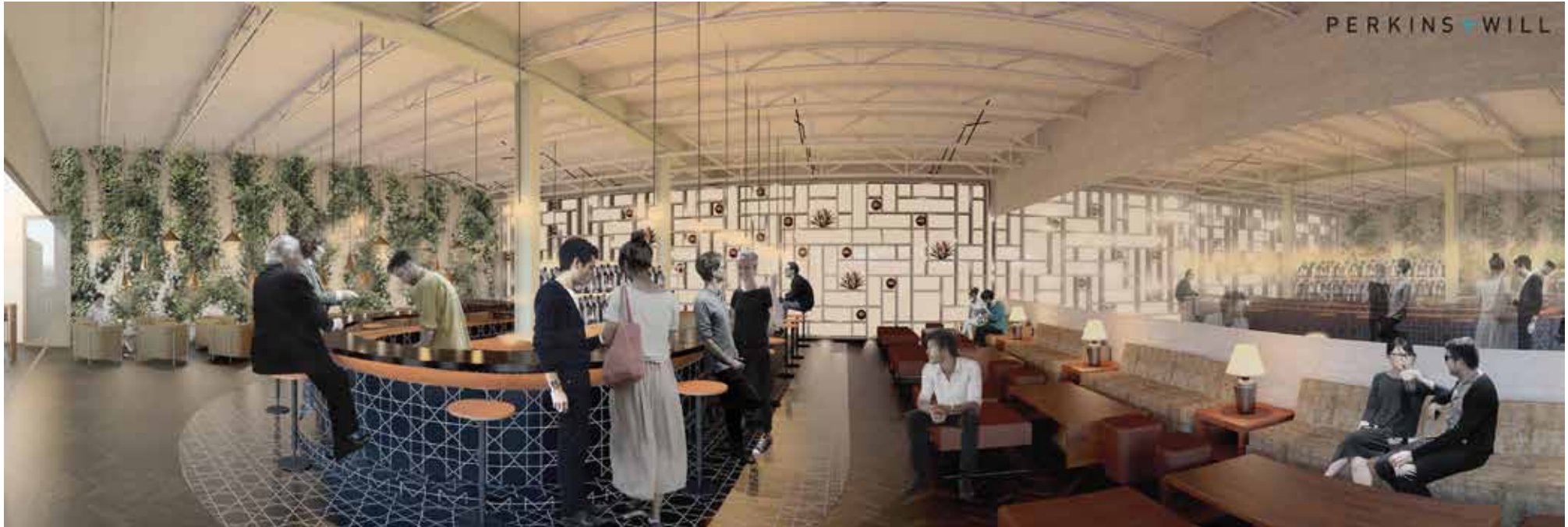
Interior rendering is conceptual

$24/SF modified gross — office space | $28/SF NNN — restaurant space